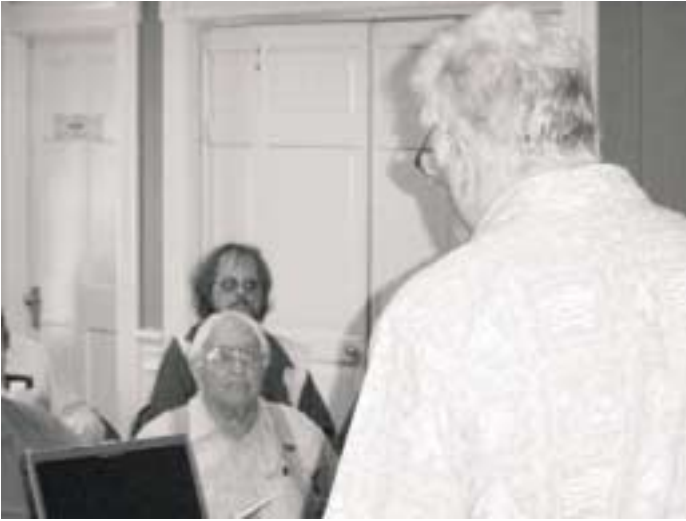
Many questions awaited Stenger after the lecture

Unscrupulous and, by and large ignorant, people have suggested that science—especially modern science in the form of quantum physics—has validated many of their age old beliefs, including belief in the supernatural.