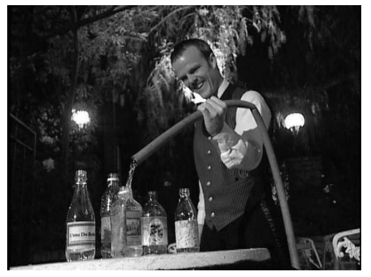
At a trendy restaurant all the bottles were filled from a hose, and customers raved at the high-end tap stuff.

Depressingly, the Cobb County school board voted to put a cautionary sticker in the biology books pointing out that evolution is only a theory (and presumably should not be trusted). Even more depressing, this outcome is far from isolated in the U.S.