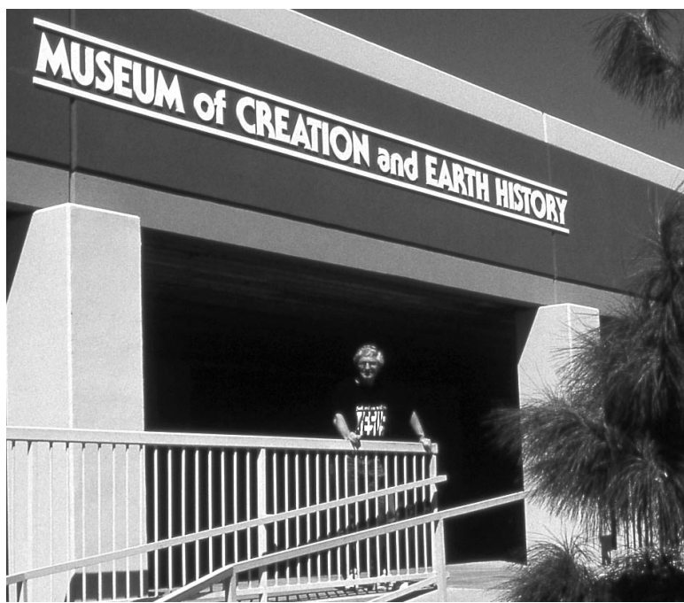
At the ICR in 1995. The facility in Santee, CA, was a wonderful tribute to a creationist view of science. So why am I smiling?

We have followed the doings of the ICR for over 20 years, and it's been a fun ride. If you want to see creationism in its purest form, here it is. You want to embrace the golden calf? Ankle, and thigh, and upper half? Here it is -I mean here it is. ^2