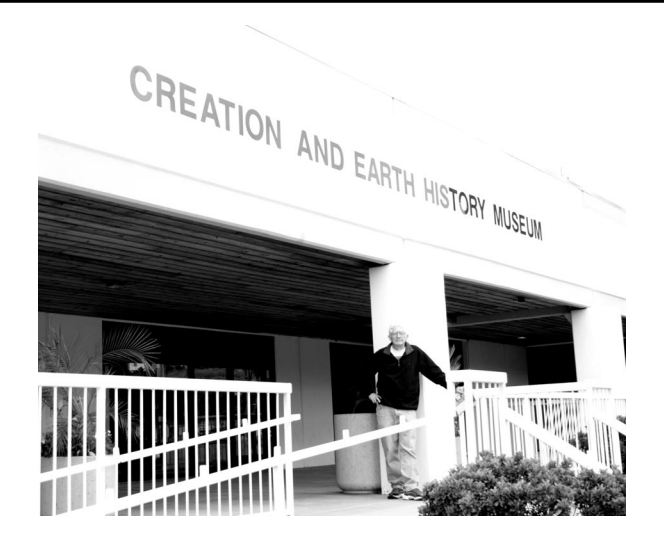
The ICR in 2009

What a difference 14 years make. I have gotten older, but the ICR has stayed rock steady.